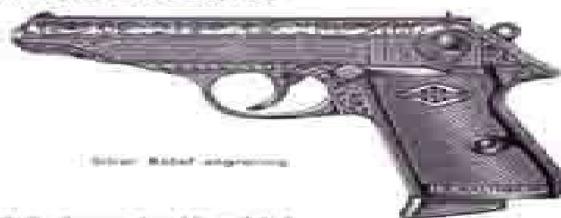
Silver Relief engraving

All our types can be executed nickel plated, silver and golden plated, with or without engraving, with matched steel plates.