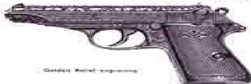
Golden Relief engraving