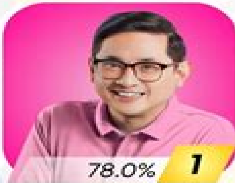
S. AQUINO, BAM (KNP)

MSU-MCSE SENATORIAL PREFERENCE SURVEY RANKING