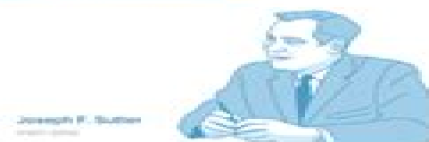
Joseph F. Sutter

THE 747-400 IS THE FIRST AIRCRAFT IN THE WORLD TO BE DESIGNED WITH A FULLY INTEGRATED CABIN, WITH PASSENGER AND CARGO SPACE, INCLUDING OVERHEAD BINS, ALL IN ONE CONTINUOUS FLOW. IT'S THE ONLY AIRCRAFT IN THE WORLD WITH A FULLY INTEGRATED CABIN, WITH PASSENGER AND CARGO SPACE, INCLUDING OVERHEAD BINS, ALL IN ONE CONTINUOUS FLOW.