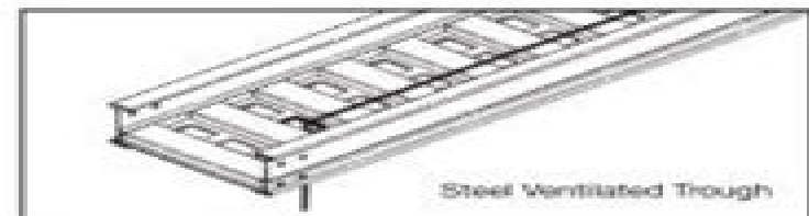
Steel Ventilated Trough

If you are still uncertain as to which rung spacing to specify, 9 inch rung spacing is the most common and is used on 80% of the ladder cable tray sold.