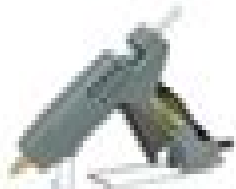
Hot glue gun