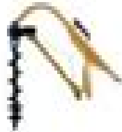
Post hole digger