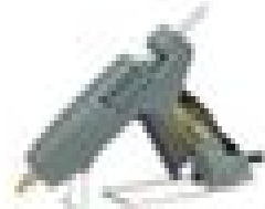
Hot glue gun