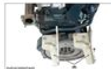
(2) DPF bracket