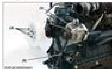
(2) Alternator (3) Cooling fan mounting screw