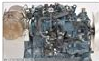
(2) Oil separator