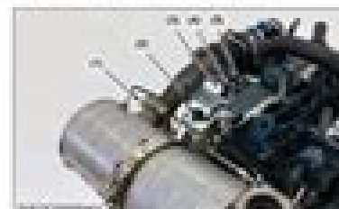
(2) Muffler flange nut (2) Clamp (2) Connector of exhaust gas temperature sensor (2) (2) Connector of exhaust gas temperature sensor (2) (2) Connector of exhaust gas temperature sensor (2)