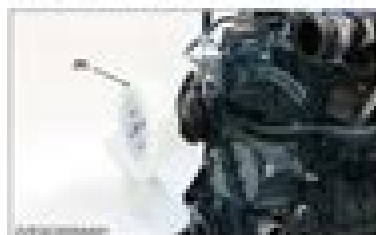
(2) Cooling fan (2) Fan pulley