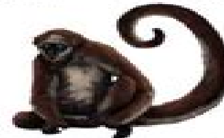
Black-handed Spider Monkey