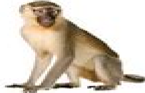
Common Squirrel Monkey