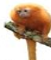
Black Lion Tamarin