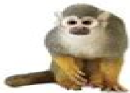
Central American Squirrel Monkey