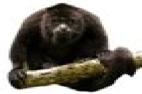
Mantled Howler Monkey