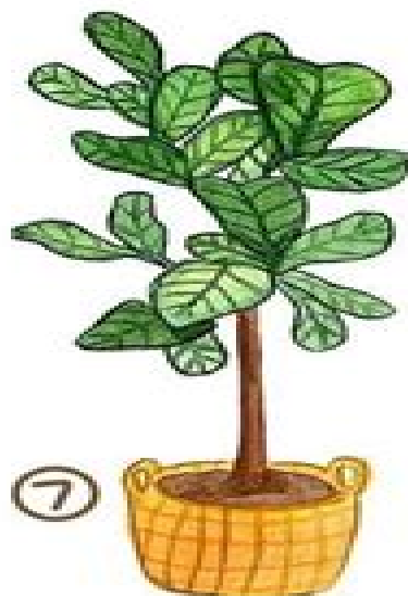
Fiddle Leaf Fig