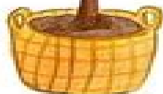
Fiddle Leaf Fig