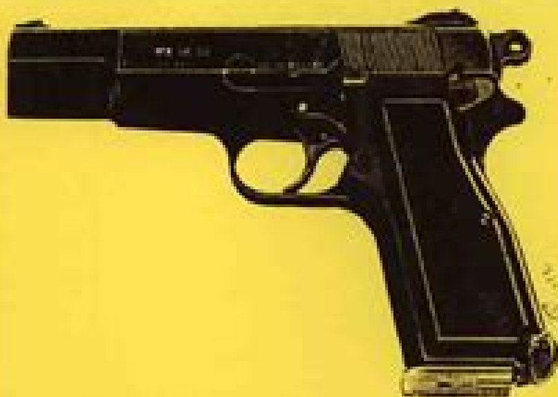
General View of Equipment