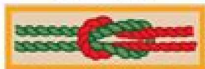
Arrow of Light Award