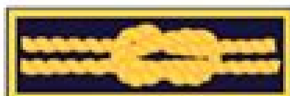
Community Organization Award