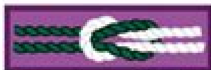
Asian American Spirit of Scouting Service Award