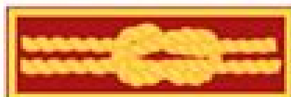
Commissioner Award of Excellence in Unit Service