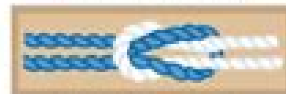
Silver Beaver Award