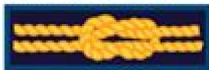
Cub Scout Den Leader Award