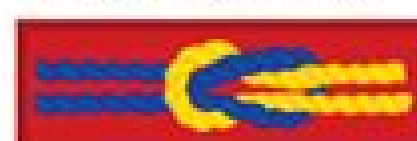
Scouting ... Vale la Pena! Service Award