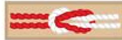
Silver Buffalo Award