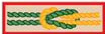
James E. West Fellowship Award