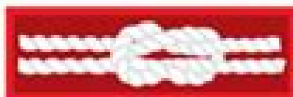
Order of the Arrow Distinguished Service Award