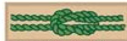
Scouter's Training Award