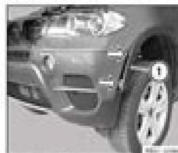
Fig. 14: Unclip Wheel Arch Cover (2) At Front On Left And Right

Unclip wheel arch cover (2) at front on left and right.