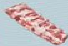
Back Ribs Braise