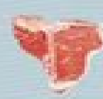
T-Bone Steak GRILL / PAN FRY