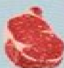
Ribeye GRILL / PAN FRY