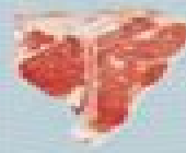
Porterhouse GRILL / PAN FRY