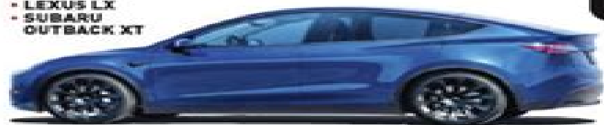
TESLA MODEL Y