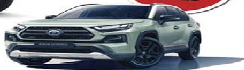
TOYOTA RAV4 HYBRID

TESTED & RATED 135 NEW SUVS, 4WDS & UTES