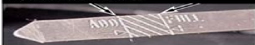
Figure 3 — Dipstick Markings