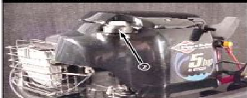
Figure 2 — Dipstick