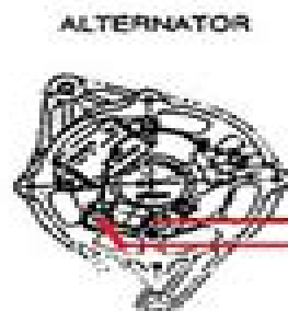
TYPICAL WIRING DIAGRAM