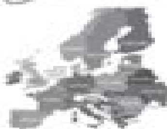
Bonn, Beethoven's hometown, is located in the western part of Germany. During the time of Napoleon, Bonn came under French control and later part of the Kingdom of Prussia. In 1871 it became part of unified Germany.

Ludwig's mother was kind and patient, but his father was difficult to get along with. He had a bad temper and was often drunk. When it became obvious that young Ludwig had musical talent, his father pushed him hard to excel. In Johann's view Ludwig was a child prodigy who could help support the family. Ludwig did not have an easy childhood, but he did have his music, which he loved.