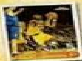
2000-01 "Rookie Card" Kobe Bryant #100000