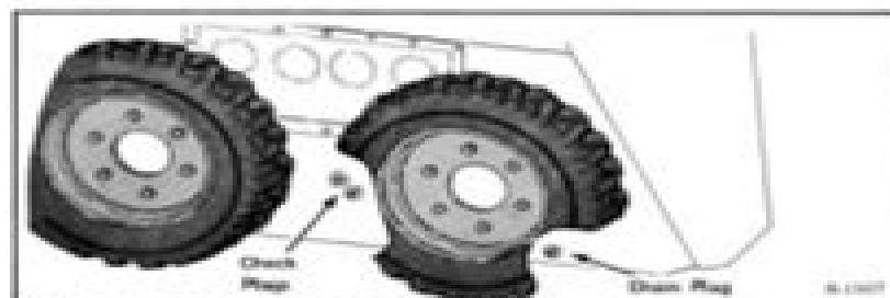
Fig. 5-3 Reservoir Check and Drain Plug