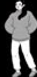
HANDS IN POCKETS