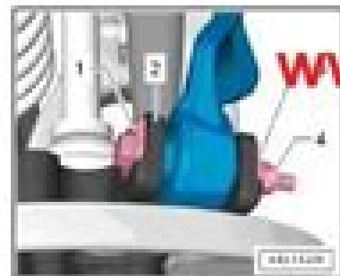
Fig. 142: Identifying Key T40049 At Rear On Crankshaft Installation

→ Remove coil spring. Refer to (2001-2002).