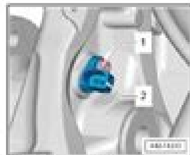
Fig. 141: Identifying Rear Axle Sensor