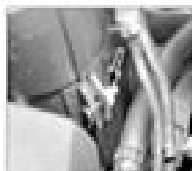
11.2 Loosen the clamp nut to remove the fuel filter on 4-cylinder engines