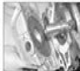
11.3j Remove the oil pump