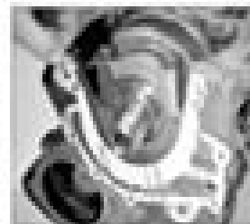
11.3k ... and gasket (H&I) engine