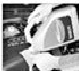
11.1c Use a towel when wiping oil to the engine

funnel may help to reduce spillage (see Illustration ). Pour at first the quantity required of oil into the can and allow it to fill up to within 100 mm of the top. Continue adding in a small quantity at a time until the level is up to the lower mark on the dipstick. Adding around 1.5 litres will bring the level up to the upper mark on the dipstick. Add the 5-litre oil. Start the engine and run it at 1400 rpm for a few minutes, check for leaks around the oil filter seal and the timing chain ring. Note that there may be a few seconds after before the oil pressure warning light goes out after the engine is started, as the oil