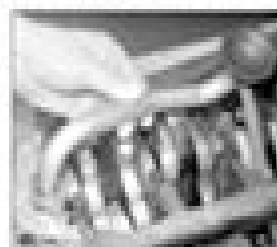
11.3g ... and remove the oil pump tube (H&I) engine