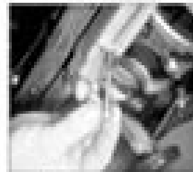
11.3a Loosening the bolts