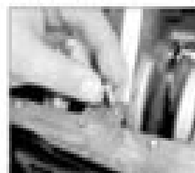
11.3f ... and the bolts from the support bracket