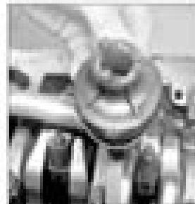
11.3d Loosened by the engine from the oil pump tube (H&I) engine

11.6 Connect the mounting hole and withdraw the oil pump over the fuelhead and from the front of the cylinder block. Remove the gasket. Note that the other timing cover is removed with the oil pump mounting hole (see Illustration ).