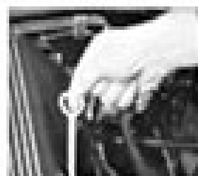
11.1a Removing the oil filter cap