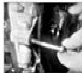
11.3i The other timing cover is inserted to the oil pump with the long bolts