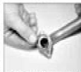
11.3h Removing the timing cover from the gasket (H&I) engine