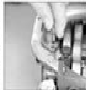
11.3e Loosening the bolts from the oil pump