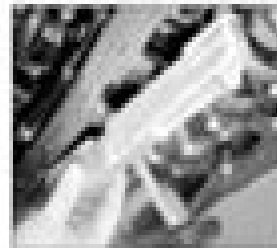
11.3b ... and remove the cracked and weakened fuel (H&I) engine