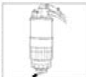
11.2 Water drain screw on the bottom of the fuel filter

11.2 Connect the empty fuel and air out the fuel filter without disconnecting the incoming fuel hoses (see Illustration ).