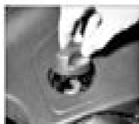
11.1b ... and wipe cap on the 5-litre 5-cylinder engine