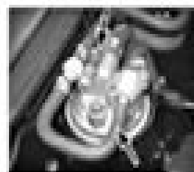
11.1 Examine these holes before removing the fuel filter on 4-cylinder engines

11.3 If any pads appear worn, it is vital to the specified thickness or less, of the pads must be replaced as a set.