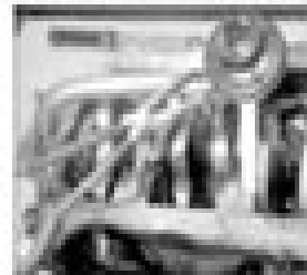
11.3c Using safety pin, remove the spring

remove the cracked and weakened fuel head the bottom of the fuel head (see Illustration ).