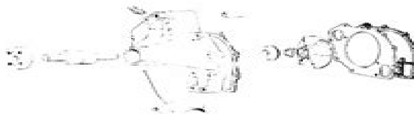
351"C, 400", 429", 460" ENGINES WATER PUMP