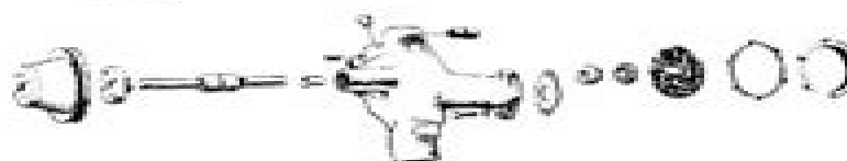
352", 390", 410", 427", 428", 430", 462" ENGINES WATER PUMP