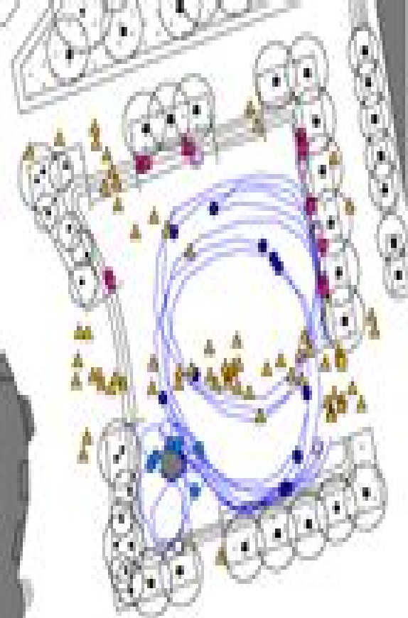
Daily occupancy Bristo Square