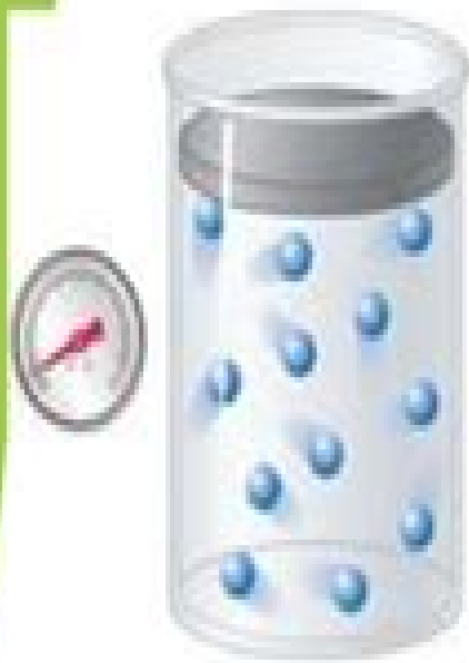
(a) Low pressure