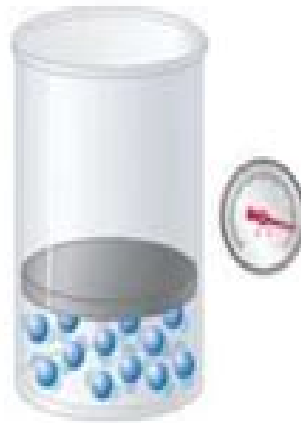
(b) High pressure