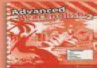
Teacher's All-in-One Pack