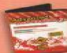
Digital Teacher's Pack containing: