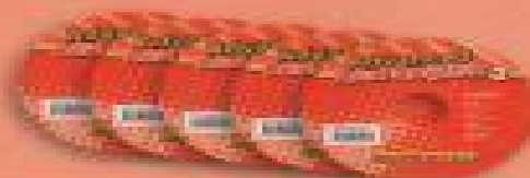
Class Audio CDs