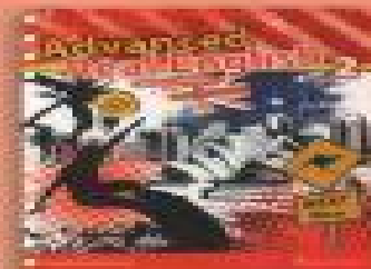
Teacher's Manual (interleaved with Student's Book)