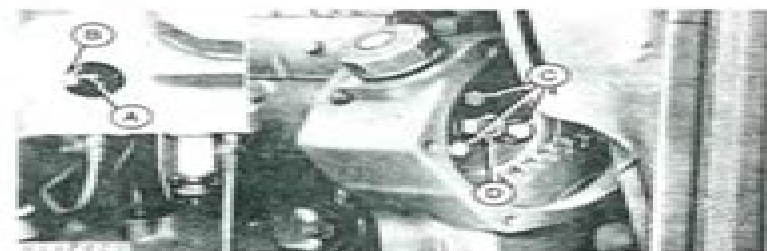
A—Drive Hub Mark B—Pointer Mark

5. If timing is correct, replace plugs and reconnect hose.