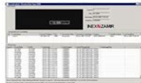
Optional Access Control Soft- ware provides gate control