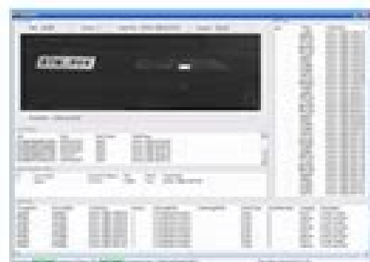
Optional Alert Management System matches license plate numbers to a data base.