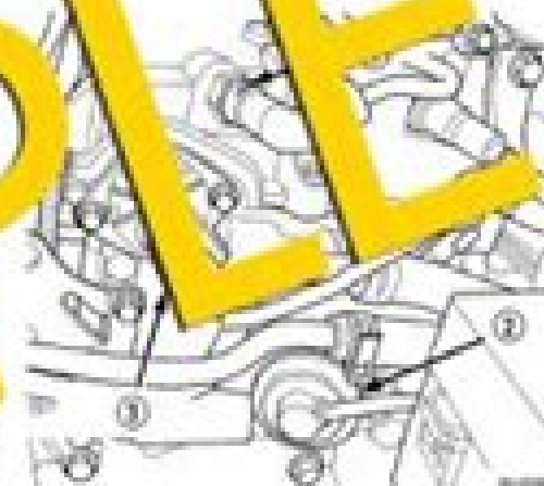
Fig. 1 Camshaft Position Sensor - 2.0L-4L, DOHC

The PCM sends approximately 5 volts to the Hall-effect sensor. This voltage is required to operate the Hall-effect chip and the electronics inside the sensor.