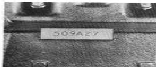
FIGURE 1 — Engine Code Typical Location