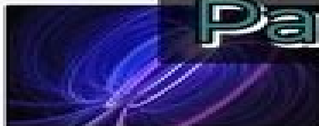
Unit 4: Electromagnets