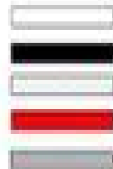
Small white plug x13598