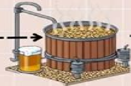
Step 3: Mashing