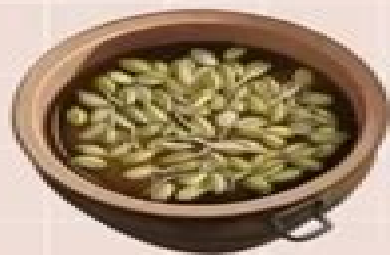
Step 1: Malting