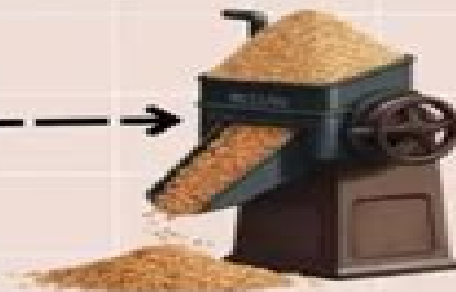
Step 2: Milling