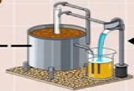
Step 4: Lautering