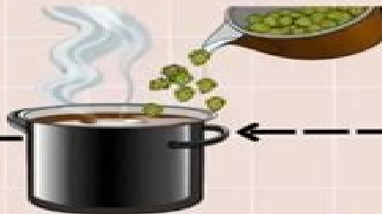
Step 5: Boiling and Hopping