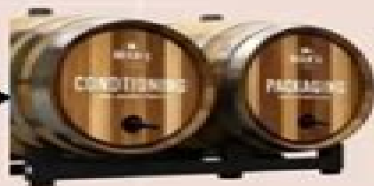
Step 7: Maturing