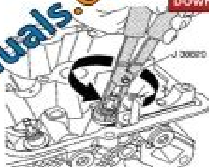
Fig. 101: Using J 38002 To Replace Valve Seal

IMPORTANT: The valve stem seal should not be removed unless replacement is required.