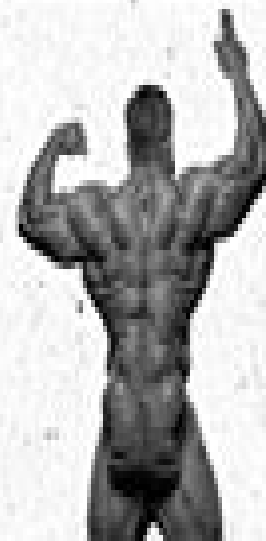
REAR DOUBLE BICEPS