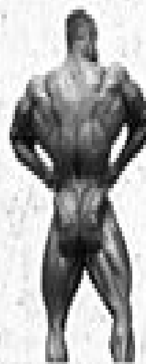
REAR LAT SPREAD