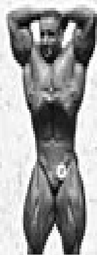
ABDOMINAL AND THIGH