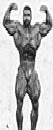
FRONT DOUBLE BICEPS