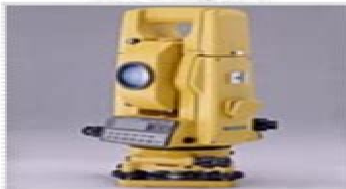
Electronic Total Station GTS-2R series 1988