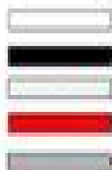
Small white plug x13598