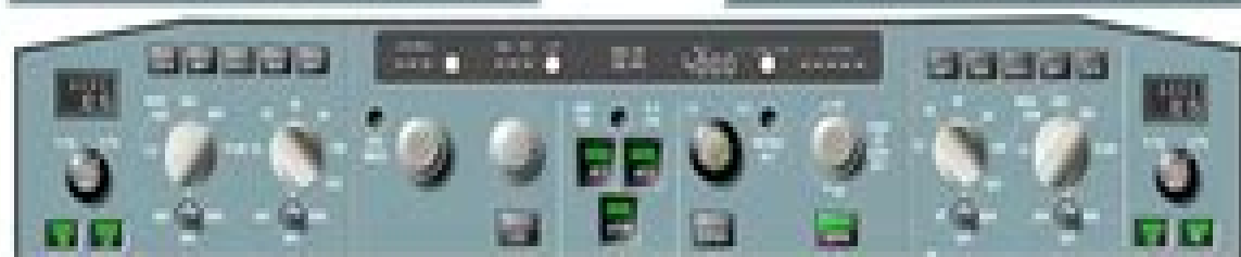
FLIGHT CONTROL UNIT (13 VU)