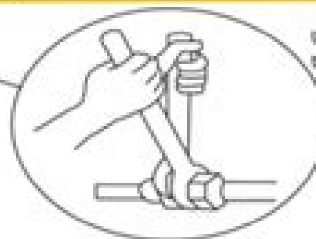
Use 2 wrenches to tighten fittings