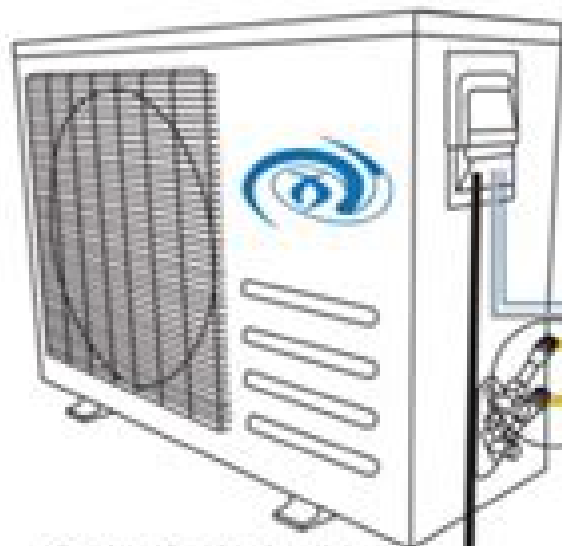
Outdoor Condensing Unit