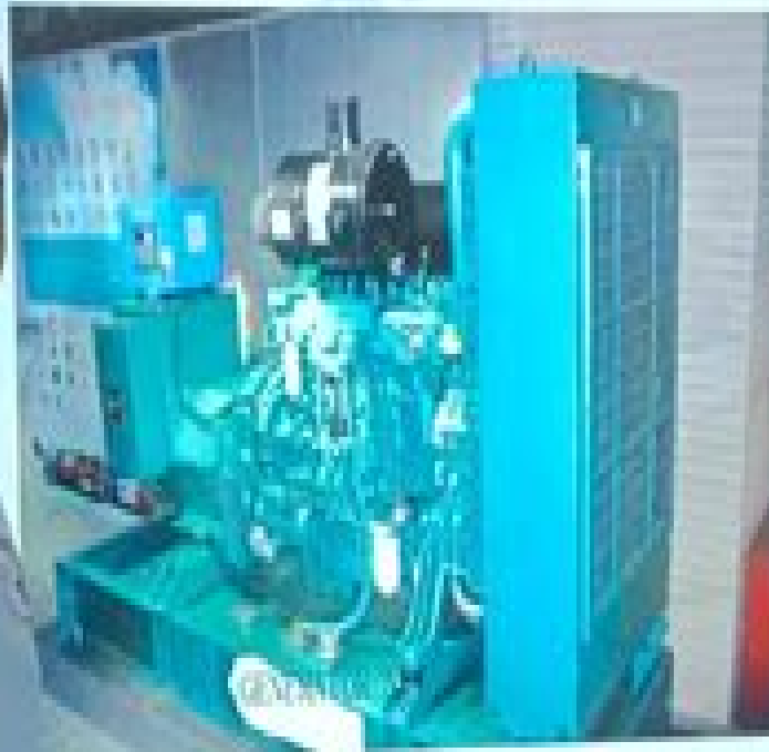
Water Cooled Diesel Generator