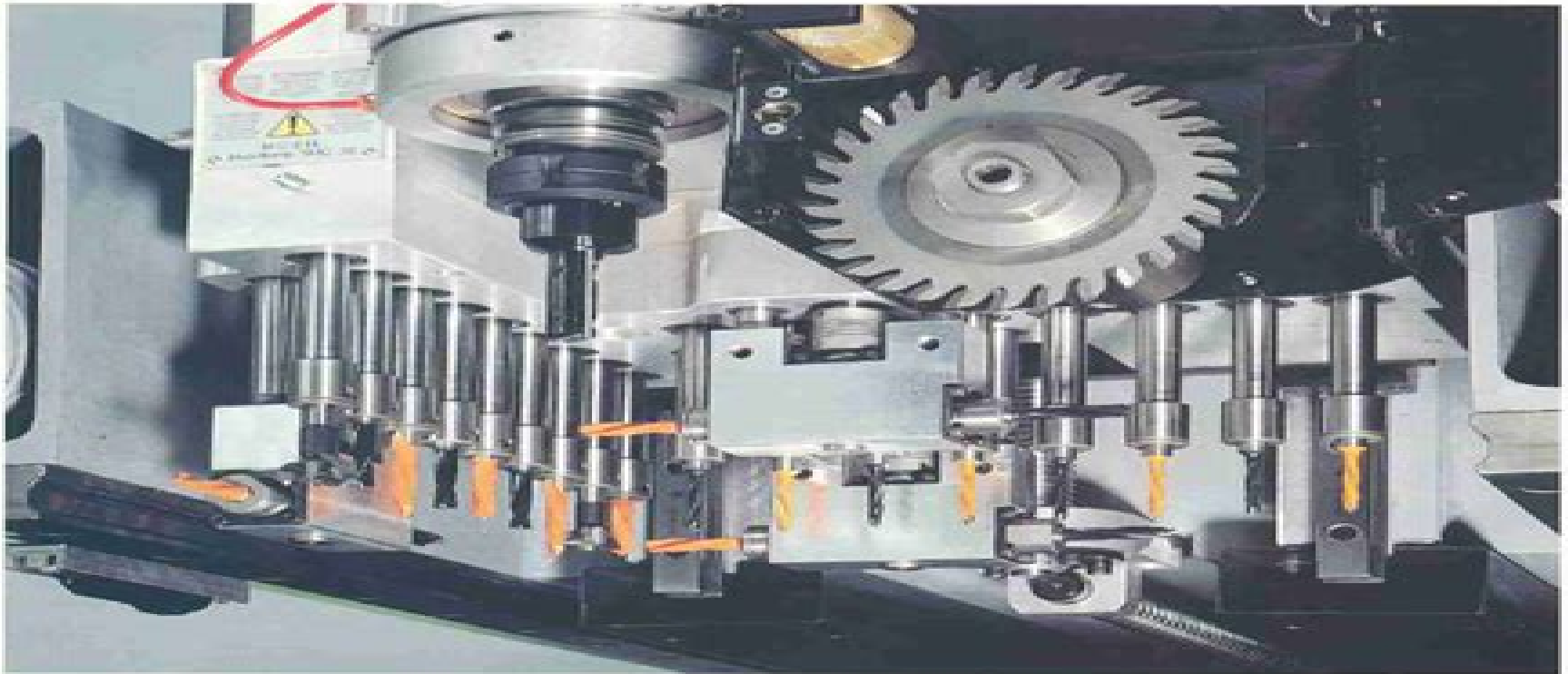
— 2014 —