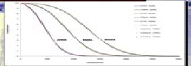
Comparison of SCM with CTRANW and Analytical Solution