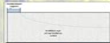
Example2: 2D numerical model of contaminant transport polluted lagoon