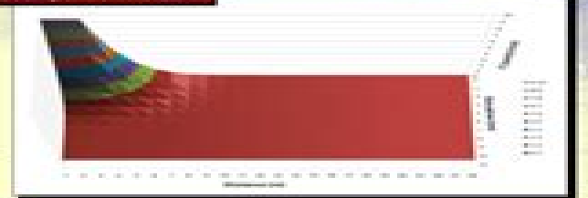
A sample of result of SCM