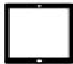
iPad (5th generation) iPad Air 2 iPad Air iPad (4th generation)