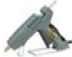
Hot glue gun