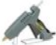
Hot glue gun