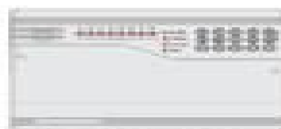
Figure 1-2: Accenta/Optima software interface showing a graph of a signal waveform with a red line.