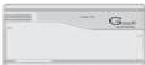
Figure 1-1: Accenta/Optima software interface showing a graph of a signal waveform.