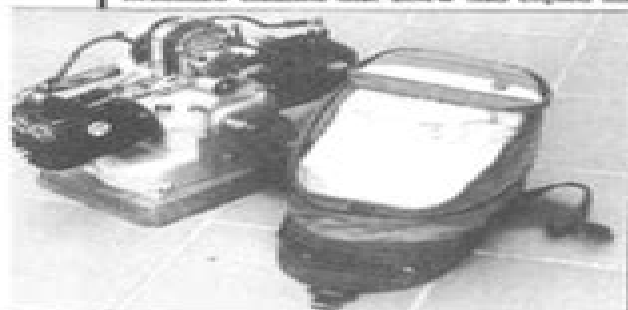
The engine from BMW's first motorcycle, the 1923 R32. The tank bag shows the unit's compact size.