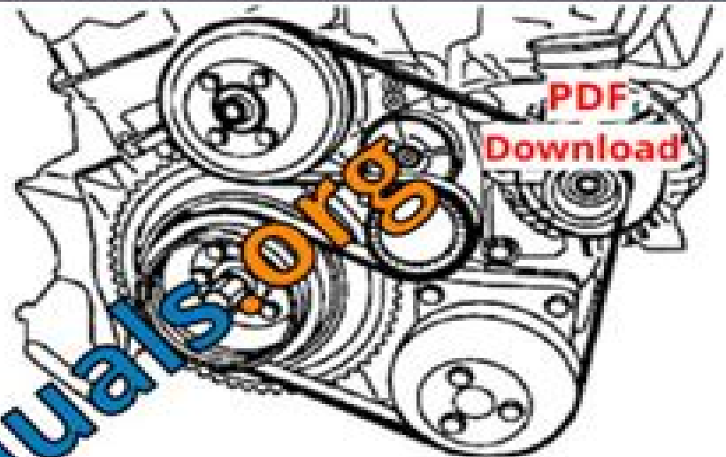
Timing Drive Belt Running Without Auxiliary Tensioning Pulley (M52, M54 & S52) BMW OF NORTH AMERICA, INC.