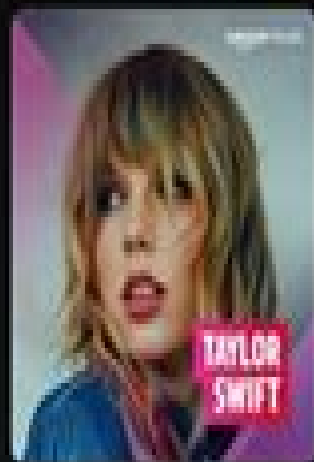
STATION Taylor Swift