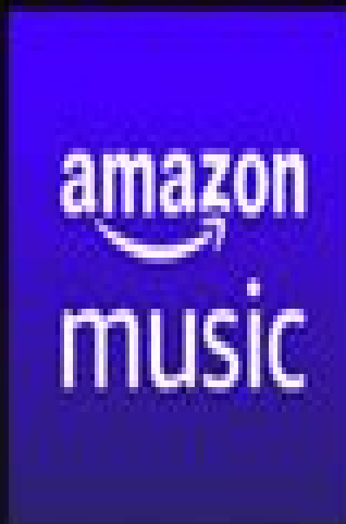
STATION I Only Have Eyes for You