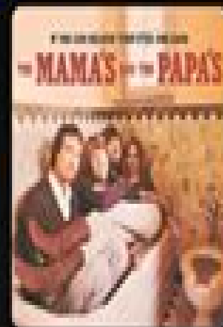
STATION California Dreamin' (Si...)