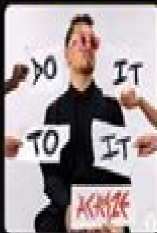
STATION Do It To It (feat. Cherish)