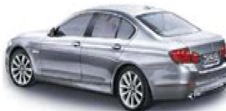
Fig. 1: Identifying BMW 5 Series Saloon Courtesy of BMW OF NORTH AMERICA, INC.

The F10 5 Series was introduced in to the US market in March of 2009. The vehicle is available in 528i, 535i and 550i models.