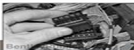
Extensive electrical component location information. 601 Electrical Component Locations