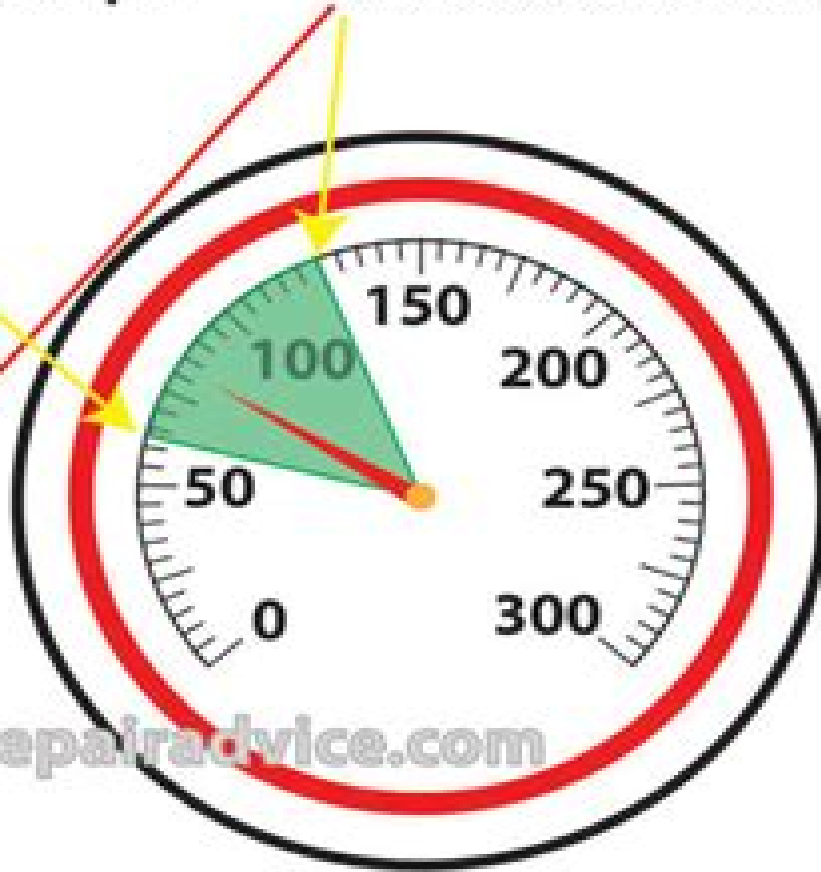
High Pressure Gauge